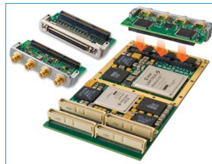
Plug in an AXM analog or digital I/O module for additional I/O signal processing capabilities.

Acromag's Engineering Design Kit provides software utilities and example VHDL code to simplify your program development and get you running quickly. A JTAG interface enables on-board VHDL debugging.